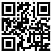
Series 1100 MEGALUG Installation Instructions

Additional Information may be found at www.ebaa.com .